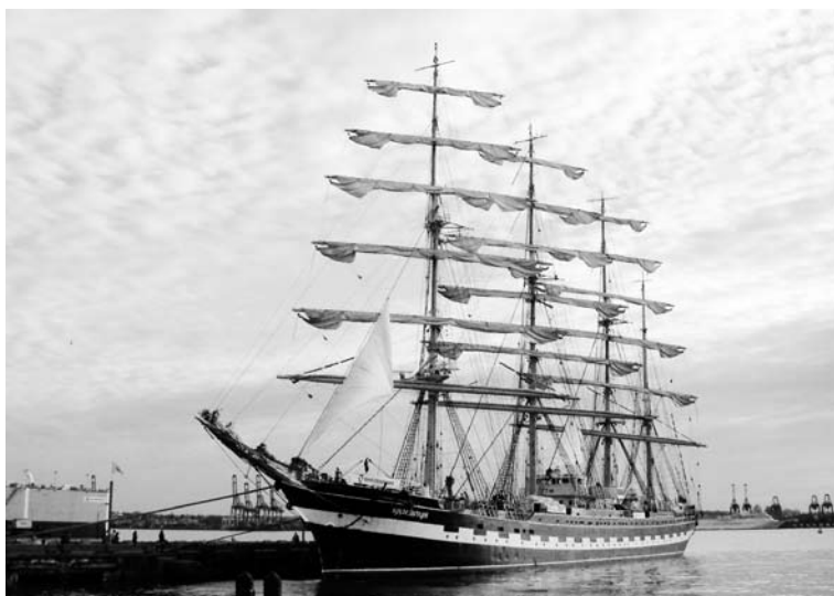
The Kruzenshtern docked in North Vancouver during the Olympic Games.

The ship also participates in modern sailing regattas every year, with many silver trophies and other awards to attest to its winning status. For example, sailing from Boston to Liverpool, it won the grand Columbus '92 regatta, held for the 500th anniversary