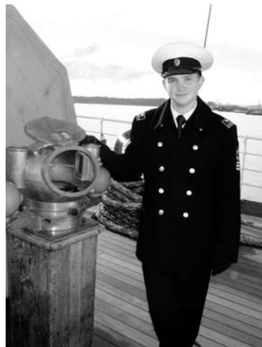
Russian cadets (above left and right) live and learn aboard the tall ship Kruzenshtern as it sails around the world.