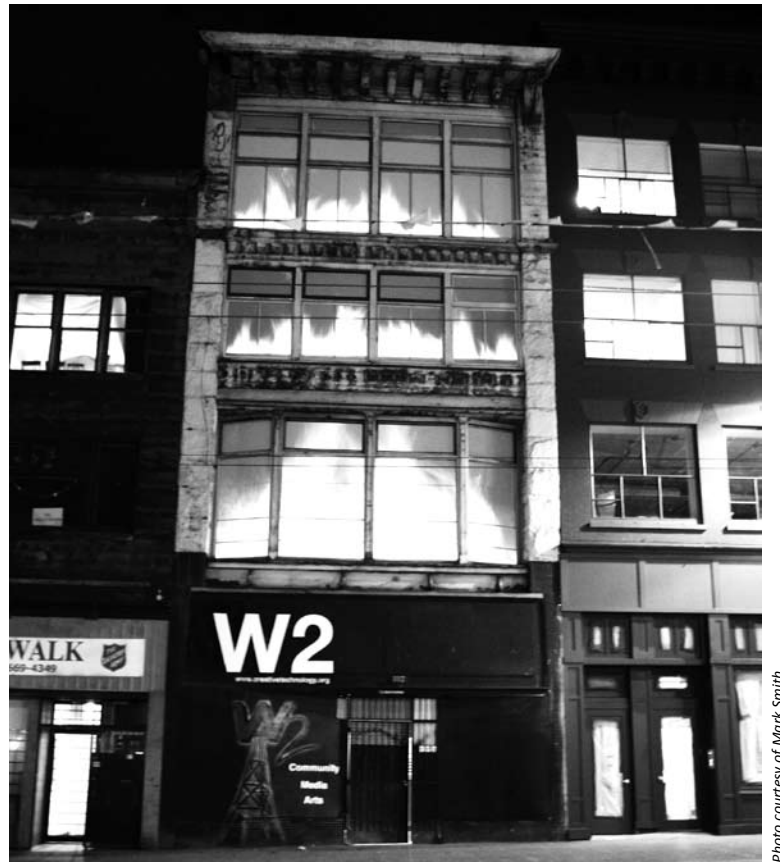
In addition to supporting media production, W2 also exhibits art installations.

For example, until March 14 visitors can take in Karilynn Ming Ho's installation Versions 1,2,3 , which explores the complexities of representation and the