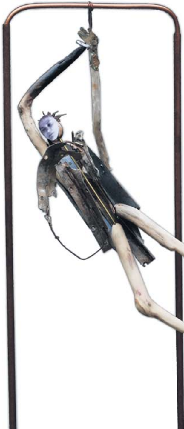
Persimmon Blackbridge's sculptures are a metaphor for living with a disability.